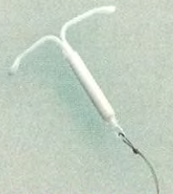
Progestin-Releasing Intrauterine System (IUS)