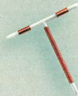
Intrauterine Device (IUD)